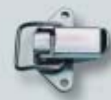
— toggle- latches